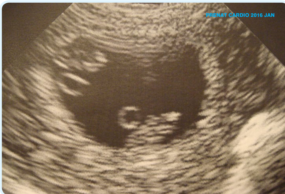
Fot. 1 Twin pregnancy at 6 weeks of gestation suspected for monochorionicity. This photo should be kept for the whole pregnancy and later on be included in newborns medical history