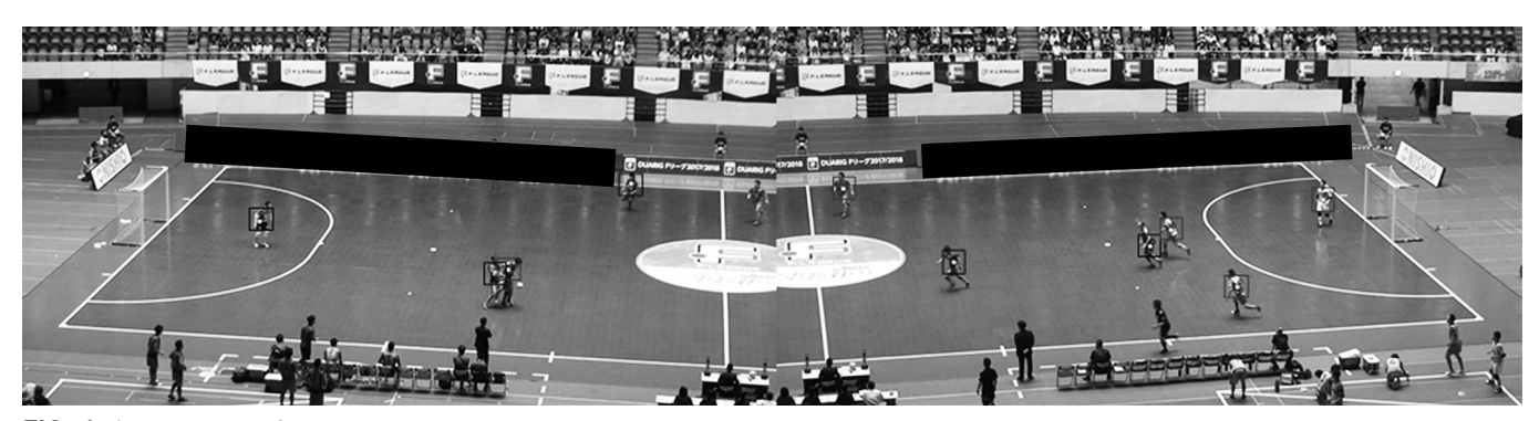
FIG. 1. Image processing.

Physical match performance was evaluated based on image processing using the semi-automatic tracking system [17]. The videos were recorded by two commercially available high-density cameras (HDR-CX560, SONY, Japan). The cameras were fixed on tripods, and the left and the right courts were captured with each camera. Figure 1 is a composite image of two images recorded by the automatic tracking system. The size of each image was 1920 \times 1080 pixels at a frame rate of 60 fps, and the videos were recorded in the progressive mode. The recording position was approximately 20 m away from the nearest touch line, and the height of the position was approximately 20–30 m from the court. The position information of the players was measured at a sampling interval of 1/20 seconds. In cases of tracking error due to overlapping of players in an image, the measured data of the target player were corrected by using a pen tablet (Intuos Draw CTL-490, Wacom, Japan). In this study, the automatic tracking rate was 82.4 \pm 3.7%. The player's positions were determined by applying a 19-point moving average filter to the measured data. From the determined player position, the movement distances and velocities were calculated every 1/20 second. A player's speed was determined using a 5-point median filter. The measurement