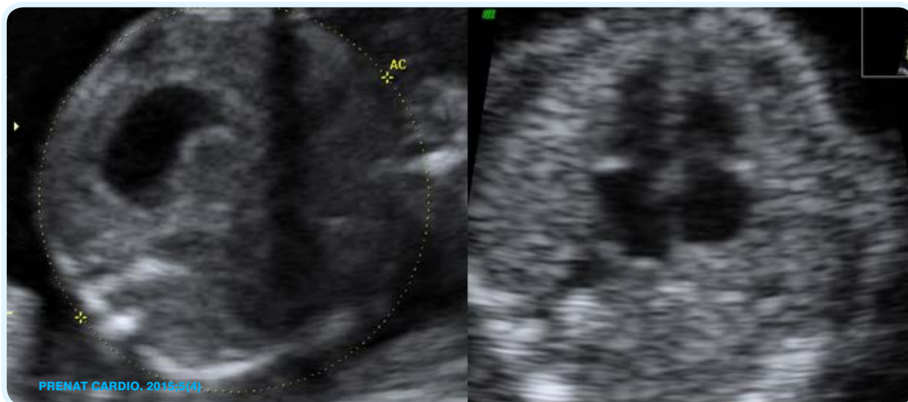
Fig.3. Fetal heart apex on the same side as stomach: meaning in this case levocardia and normal heart size. Next step is to evaluate fetal heart anatomy

that a dedicated special delivery room is unnecessary. Our state of art article with international cooperation are now in press in one of the Thomson Reuters journal.