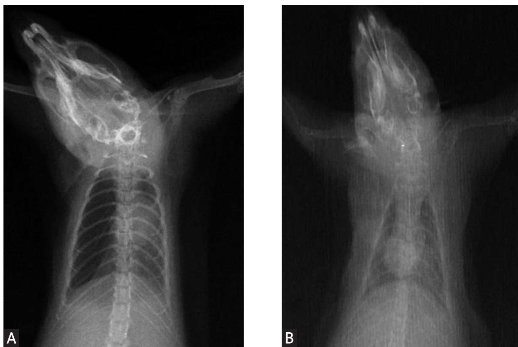
Figure 2. Pneumothorax (A) and reexpansion (B) were confirmed with control chest X-ray in all groups

First 10% buffered formaldehyde was used to fix the lungs; later on they were embedded in paraffin blocks. Slices of about 4 \mu m thickness, obtained from paraffin blocks, were stained with hematoxylin-eosin. Existence of a pulmonary edema was investigated by a pathologist.