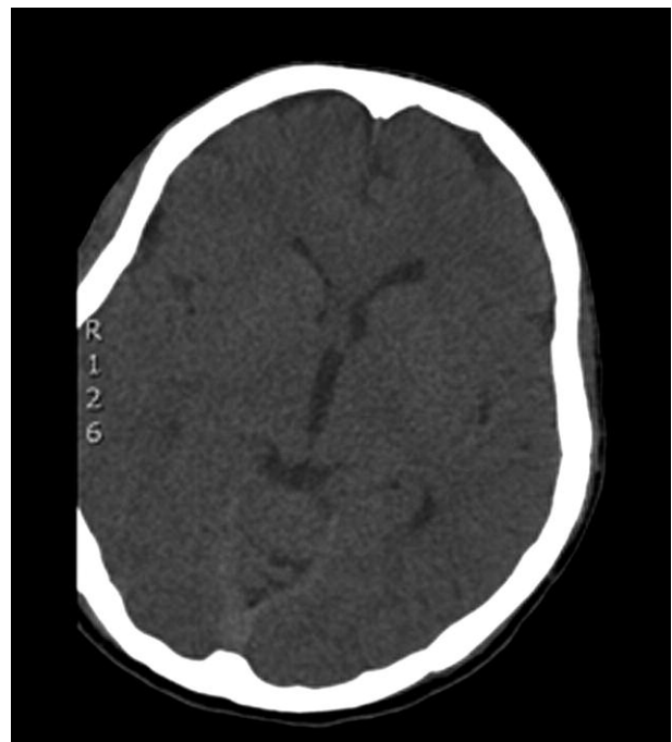
Fig. 2. Computed tomography Ryc. 2. Badanie tomograficzne głowy

The pathophysiology of transient cortical visual impairment is not clear. Most likely, the blood-brain barrier becomes damaged, which allows the contrast agent to express a direct neurotoxic effect on nerve cell membranes in the occipital lobes [1]. In the majority of cases described so far, the computed tomography image showed post-contrast enhancement in the occipital lobe, which may be related to body