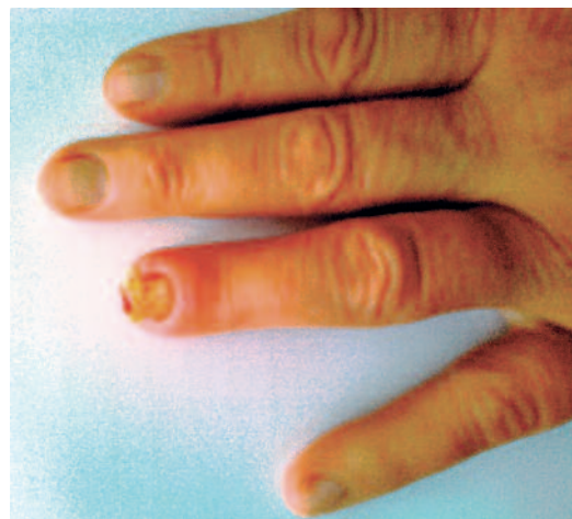
Fig. 5. Two months after the procedure, almost complete healing of the fourth finger

by thromboembolic disease, arterial injury and arthritis [4]. DM and CRI are the concomitant conditions in most of these patients [1, 2]. Patients with CHI generally experience ulcerations, tissue necrosis, and/or gangrene of the fingers which require urgent revascularization. Percutaneous intervention is preferred as a first-line therapy for arterial occlusive disease of the upper extremity [5]. Severe calcification and diffuse disease especially in patients with CRI undergoing hemodialysis are important factors affecting the success of the process. In such lesions, especially with the use of previous short balloons, the development of dissection is inevitable which affect the success of the process. However, new generation long and high-pressure-resistant peripheral balloons significantly reduced the formation of dissection and significantly increased the success of the