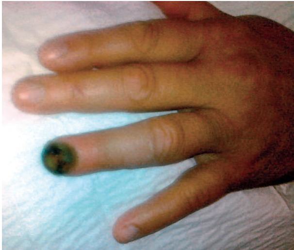
Fig. 1. Baseline lesion: fourth finger distal necrosis