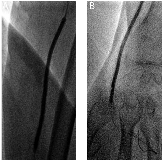
Fig. 3. A, B. Balloon angioplasty of the radial artery with 2.0 mm × 80 mm × 150 mm and 2.5 mm × 100 mm × 150 mm peripheral balloons (Fox SV, Abbott Laboratories, Abbott Park, IL, USA)