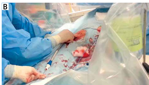
Figure 1. VA ECMO console ready to be used next to IABP in the catheterization laboratory (A). Fluoroscopy-guided percutaneous implantation of venous VA ECMO cannula in the right groin (B)