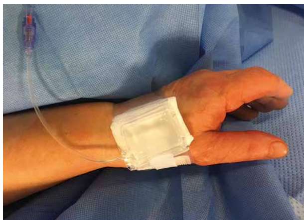
Figure 3. Site of VITRO puncture covered with a hemostatic band (Io TM Radial Artery Compression Tourniquet, COMED B.V.)

static band. Prior to discharge from the laboratory, distal radial pulses in the wrist and at the puncture site were assessed.