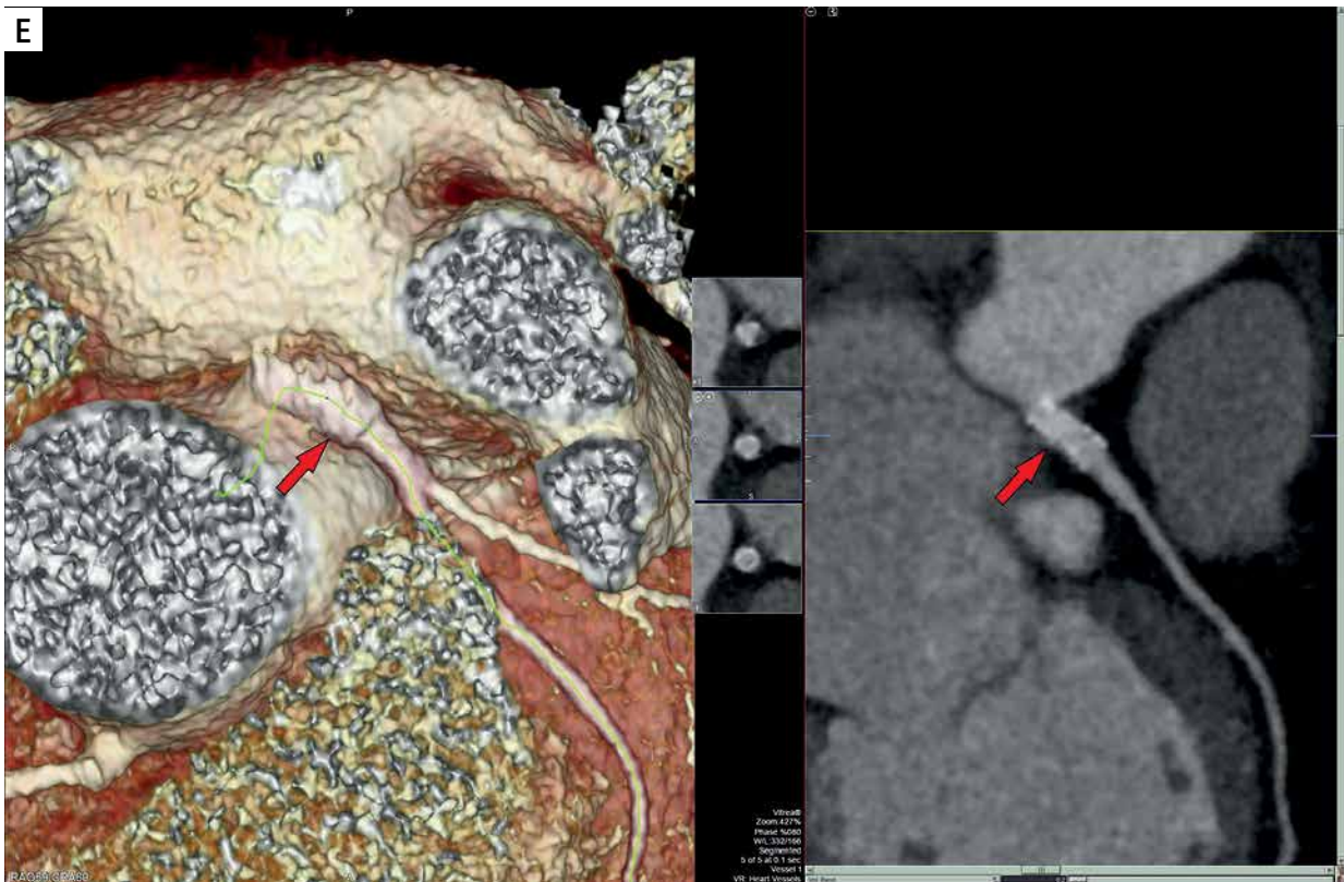
Figure 1. Cont. E – Computed tomography: after 5 months – good effect of the PCI of the left main (LM) coronary artery (red arrow)