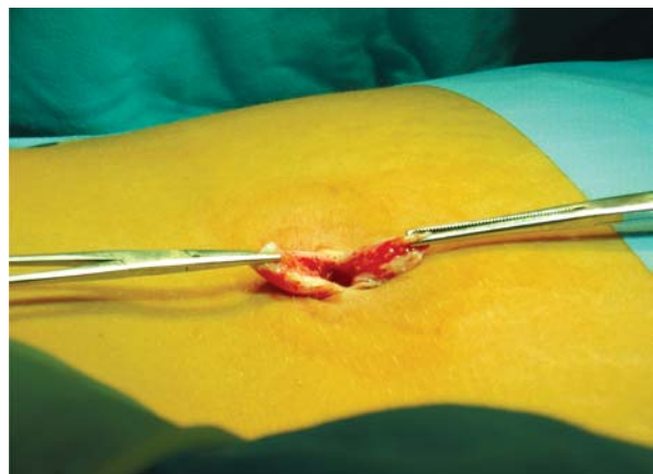
Figure 2. Incision within the umbilicus