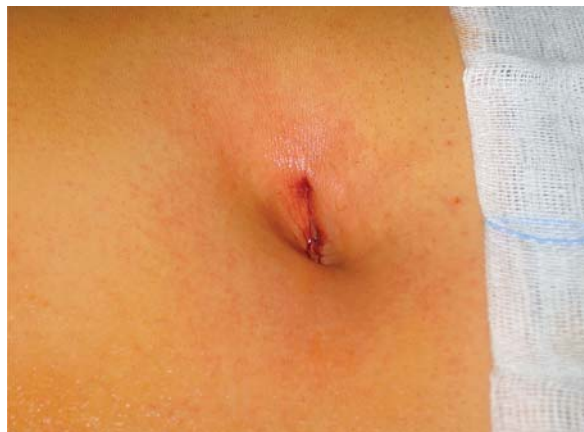
Figure 4. The umbilicus immediately after reconstruction

Initially we assumed that only patients with ultrasound documented gallstones with BMI below 30 kg/m 2 qualified for planned surgery would be included in the study. However, with increasing experience we decided that dogmatically sticking to these rules might not be necessary. In four patients BMI exceeded 30 and it was not a significant obstacle to accomplishing the procedure. Likewise, 2 patients with gallbladder hydrops were operated on. After the gallbladder content was aspirated transdermally with a 150 mm long puncture needle inserted in the right hypochondriac area, the rest of the procedure was uneventful. Aspiration did not