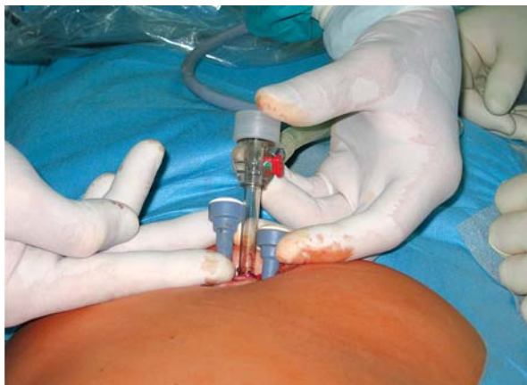
Figure 3. Positioning of the trocars in the incision

anatomical situation, laterally from this line. With such position of this suture and favourable local conditions, another suture retracting the neck of the gallbladder is not always necessary.