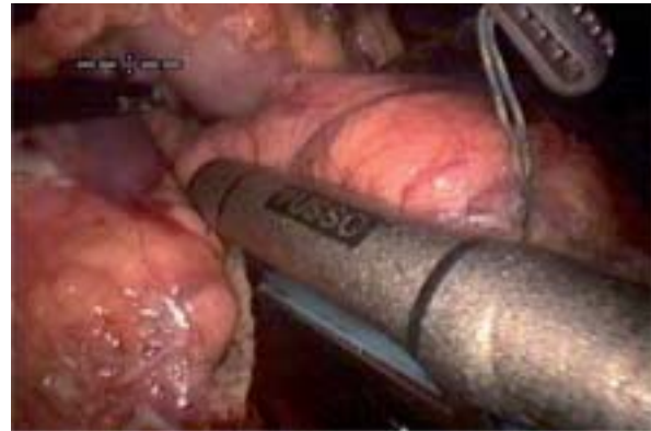
Figure 2. Distal pancreatectomy performed with a laparoscopic linear stapler

Concerning LDP, the need for splenectomy is debated. Splenectomy with distal pancreatectomy is clearly indicated in most patients with adenocarcinoma of the pancreas. However, for benign lesions or tumours with low-grade malignant potential, the issue of splenectomy has remained controversial. To