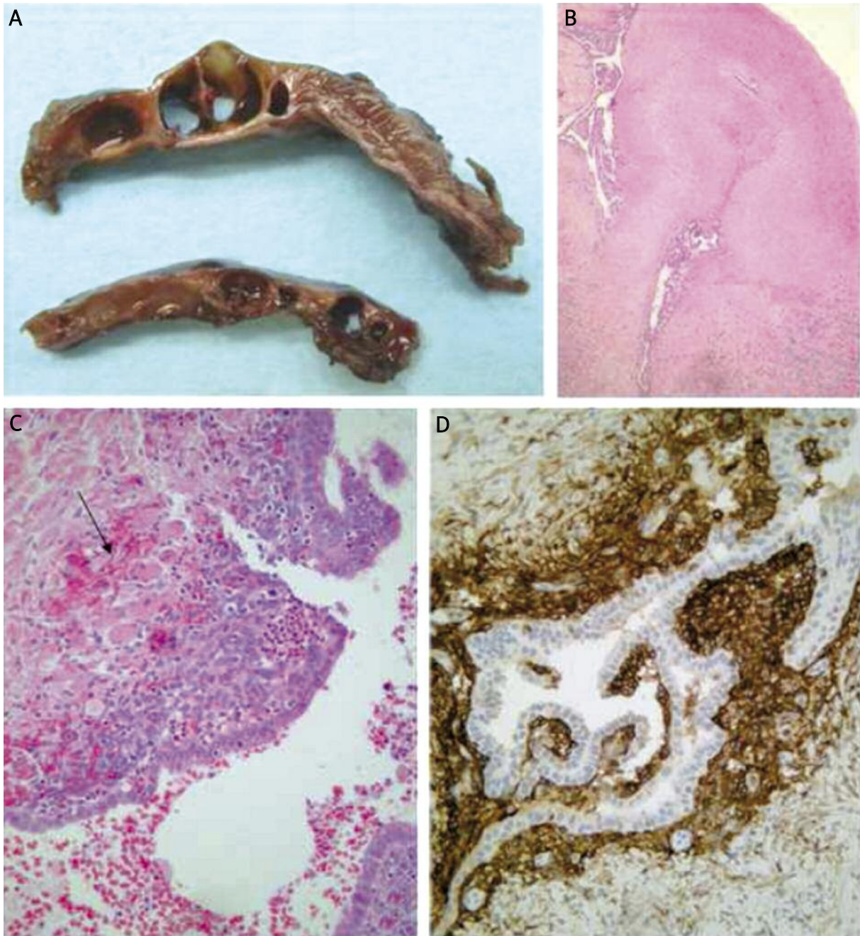
Figure 2. A – Gross section of the diaphragm. The normal architecture is destroyed by the presence of numerous endometriotic cysts. B – Histology of the parietal pericardium. The fibrous tissue is infiltrated by typical endometriosis. C – At high power a focus of endometriosis showing part of an endometriotic gland and a cuff of periglandular endometriotic stroma containing dilatated blood vessel. At the periphery myocytes are visible (arrow). D – The periglandular endometriotic stroma shows immunoreactivity for CD10

The second case was diagnosed only by computed tomography without surgical treatment and histological confirmation [34]. An experimental study in dogs reported the development of endometrial tis-