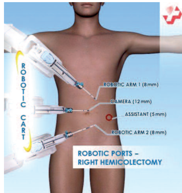
Figure 2. Port placement

Once complete, the robot is undocked and the incision for a camera port is extended superiorly to create a small midline minilaparotomy. The mobilized right colon is then exteriorized through this incision and resected. The standard side to side ileocolic anastomosis is created in open fashion.