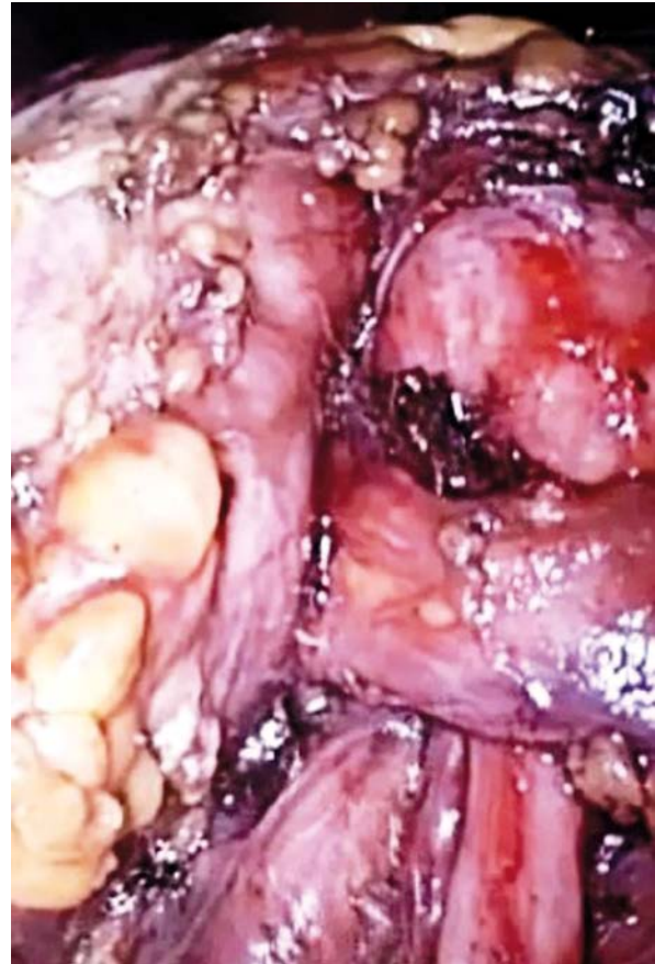
Photo 2. Lower pole of the right kidney with accessory vessel crossing the right ureter

In 1993 Schuessler first performed successful dismembered laparoscopic pyeloplasty of a pelvi-ureteric junction obstruction in an adult [6]. Following introduction of robotic surgery with robot-assisted techniques and other minimally invasive techniques, dismembered laparoscopic pyeloplasty