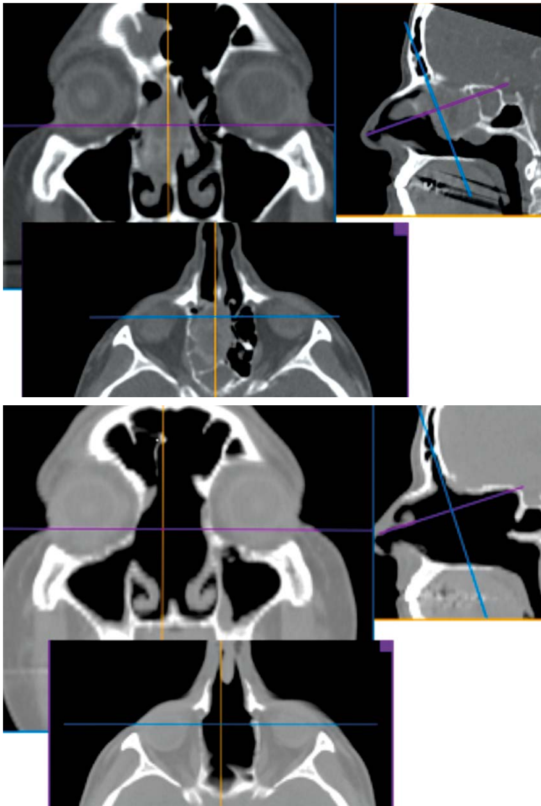
Photo 1. Computed tomography of the patient with malignant melanoma (patient 2) before (top) and after (below) the surgery