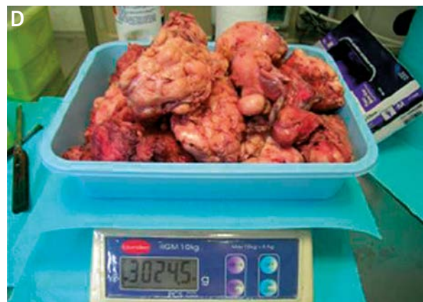
Photo 1. A – Laparoscopic picture of the huge uterus taken from the right upper quadrant. B – Utero-omental adhesions. C – Laparoscopic blade – morcellation. D – Uterine fragments weighed after formalin fixation. The weight of the fixed specimen is lower than the weight of 3030 g, detected postoperatively for the fresh specimen