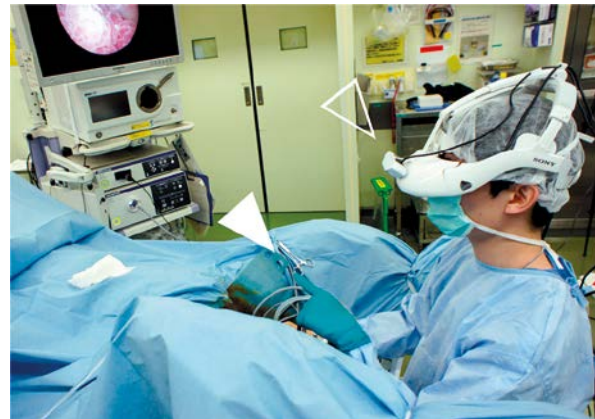
Photo 2. A scene from transurethral resection for bladder cancer in which an operator employs a pointing device using the vision-based finger tracking technique. The operator wore a head-mounted display. A video camera (framed arrow head) was mounted to track the operator's index finger (arrow head)

Many motion-capture tracking technologies are used for 3D design and animation [11–13]. Here, we selected the vision-based finger tracking technique because of its low cost and the compact size of the system. Furthermore, this technology does not require initial registration. However, the time gap between the endoscopic image and the movement of the superimposed pointer may represent a drawback of this system. Further studies are needed to