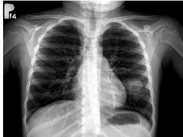
Photo 1. Chest radiograph showing a round opacity in the left lung

Microscopic examination showed a hypercellular tumour composed mostly of interlacing bundles of spindle cells with collagenous stroma and smaller areas of myxoid stroma with stellate cells (Photos 3 A–B). Cellular and nuclear pleomorphism were not observed. Tumour cells were vimentin- and smooth muscle actin (SMA)-positive, but ALK1-, S-100 protein-, CD117-, bcl2- and pancytokeratin-negative. Dense infiltration of mixed inflammatory cells including T (CD3+) and B (CD20+) small lymphocytes, plasma cells and mast cells (CD117) was noted (Photo 3 B). The proliferative index (Ki67) was low – about 5%. Based on these data, a final diagnosis of inflammatory myofibroblastic tumour was established.