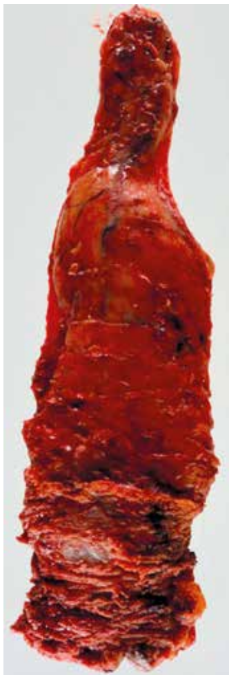
Photo 4. Operative specimen of patient 5. The specimen is cylindrically shaped, without a surgical waist

necessary, which prolongs the operation time. Moreover, total resection of the levator muscles is often not indicated from an oncological perspective and leads to unnecessarily invasive surgery with coccygeal resection in many patients [6, 10–12]. In addition, Prytz et al. reported that there is no difference between ELAPR and conventional APR in the rate of local recurrence and 3-year survival [13].