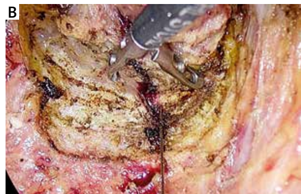
Photo 3. Laparoscopic view of the inserted needle emerging from the levator muscles