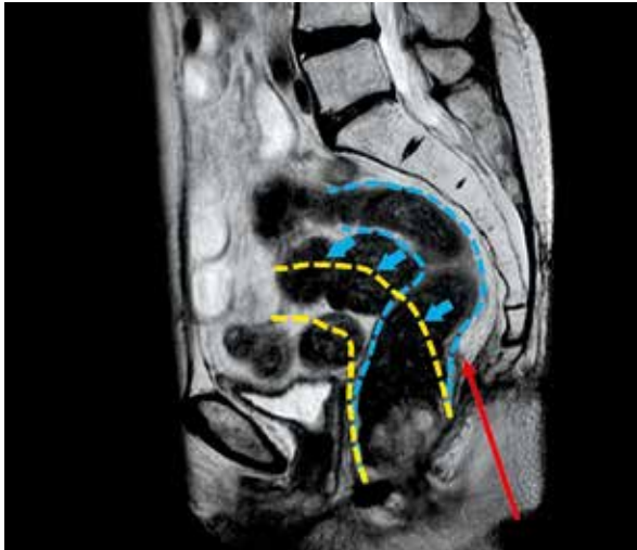
Photo 1. Magnetic resonance imaging image of patient 5 and schema showing the direction of insertion of the needle

the level of the surfaces of the levator muscles bilaterally on the dorsal side and to the caudal tip of the prostate in men or about the same level of the vaginal wall in women on the ventral side. The ureter and pelvic autonomic nerves are carefully protected during dissection. The sigmoid colon is severed with a linear stapler. The TME is not continued between the mesorectum and levator muscles. Instead, the levator muscles are dissected vertically distally to create a cylindrical specimen.