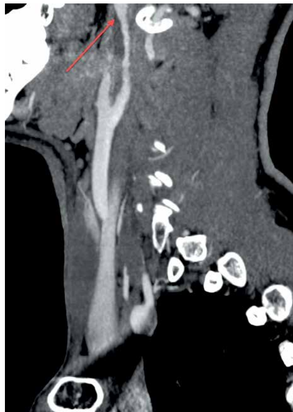
Photo 2. Angio-computed tomography – showing hypodense thrombi of the intra- and extracranial junction of the right internal carotid artery

He was referred for cervical spine X-ray and carotid artery Doppler ultrasound. The headache resolved after 8 days. Cervical spine X-ray did not reveal any significant abnormalities and Doppler ultrasound showed normal morphology of carotid arteries with no blood flow disturbances. At the next neurological examination, having no symptoms (based on interview only) he was referred for a scheduled imaging test: magnetic resonance imaging (MRI) of the head. The MRI test was performed 3 weeks after the episode. The magnetic resonance angiogram (MRA) showed the difference in the diameter of internal carotid arteries in the intracranial segment with features of the reduction of influx into the right internal artery, and the patient was suspected to have an intramural thrombus in the right internal carotid artery (RICA) observed at the lower end of the image (Photo 1). Additionally, a small region of increased T2 and FLAIR signal was identified in the right parietal cortex suggestive of ischaemic focus. Three days later computed tomography angiography (angio-CT)