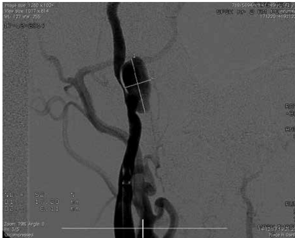
Photo 4. Digital subtraction angiography – presence of pseudoaneurysm of 17 × 8 mm in the dissection region and critical stenosis of internal carotid artery down to 0.5 mm