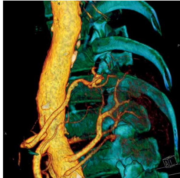
Photo 1. Pre-operative CT examination, 3D reconstruction failed to demonstrate the Adamkiewicz artery

On the first day following the stent graft implantation, the patient's condition dramatically deteri-