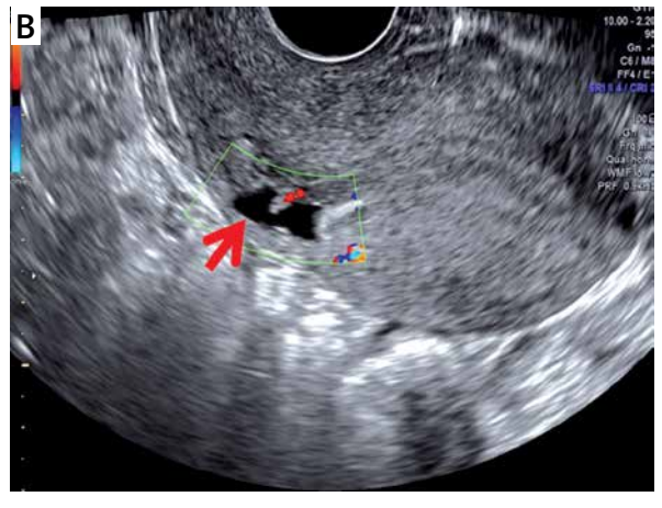
Photo 1. Transvaginal ultrasonography demonstrated post-cesarean section uterine diverticulum (red arrow)