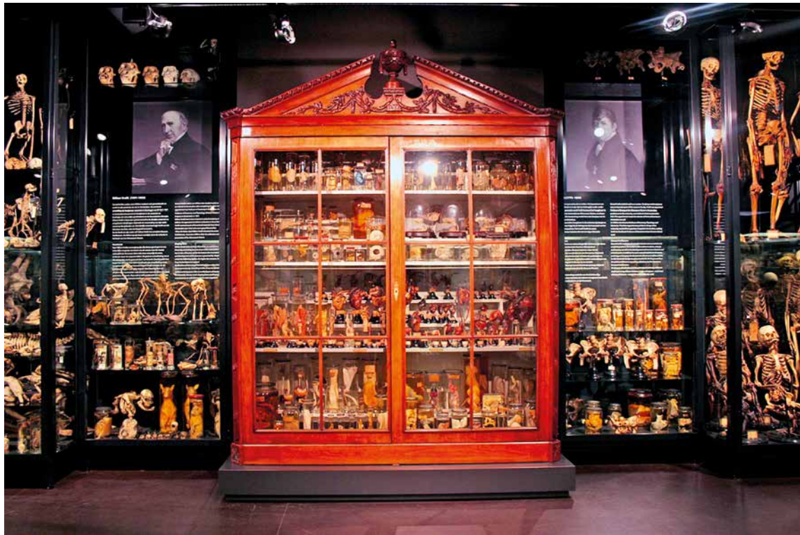
Fig. 5. Vrolik Museum, Amsterdam