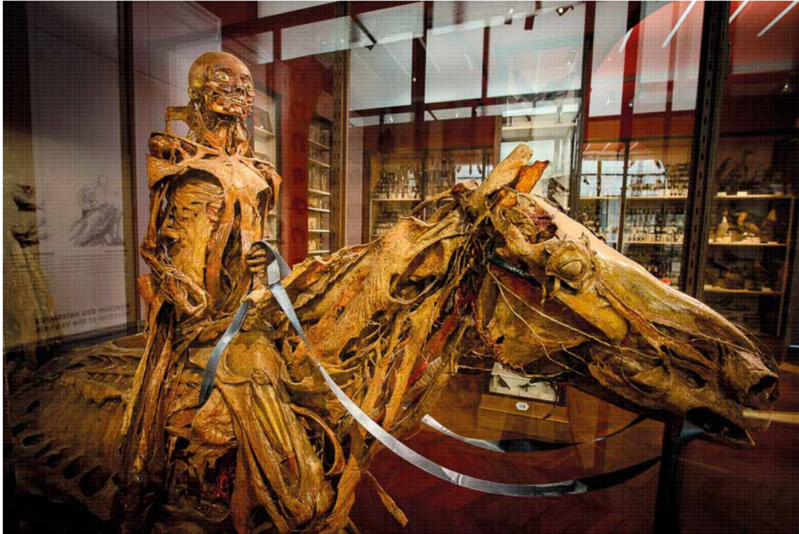
Fig. 4. Le Cavalier (1766-1771) écorché by Honoré Fragonard