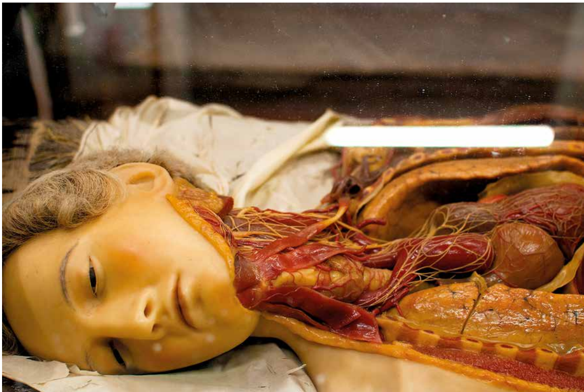
Fig. 6. Wax anatomical model from La Specola Museum in Florence

The cabinets of curiosities also functioned on Polish ground. One of them was opened in Toruń in 1594 as the Cabinet of Curiosities at the library of the Academic Gymnasium. In 1613 in Gdansk the first public autopsy in this part of Europe was performed by Oelhavius. It is also confirmed that theatrum anatomicum existed in the city at that time, serving autopsies for the students and physicians. In 1724 Johann Kulmus, from Atheneum Gedanense (Gdansk Academic Gymnasium – erected in 1558 with a separate Department of Medicine and Anatomy), performed a famous public autopsy of conjoined twins, which was described and published in detail. These twins were preserved for educational purposes for several years [12, 35, 36] (Fig. 7).