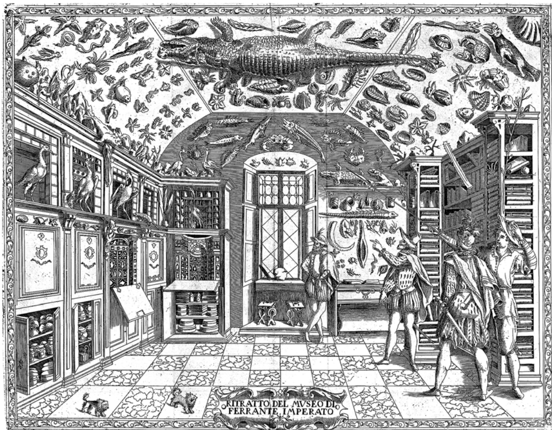
Fig. 1. Fold-out engraving from Ferrante Imperato’s Dell’Historia Naturale (Naples 1599), the earliest illustration of a natural history cabinet

From the second half of the 16 th century a more vivid interest in the interior of the human body could be observed [7, 8, 9]. This should be associated with publishing in 1543, of the first up-to-date work on human anatomy by Andreas Vesalius (1514-1564), and