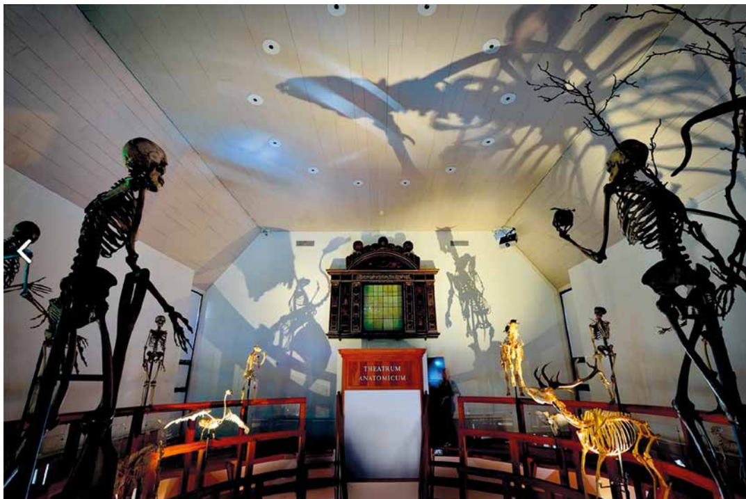
Fig. 2. Theatrum Anatomicum of the Boerhaave Museum in Leiden. Reconstructed and in 2014 brought to life to initiate the visitors into the secrets of science

In 1697 and 1717 Ruysch's collection was shown to Peter the Great, who took a course in anatomy. In Russia, the Tsar issued recommendations for performing autopsies, which were previously prohibited. After visiting Amsterdam, he purchased the whole