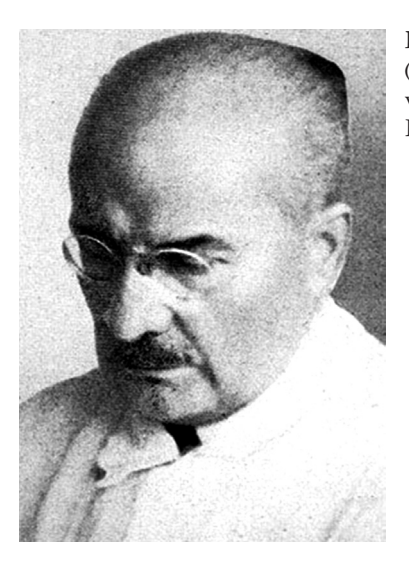
Fig. 2. A. Civatte (1910).

anoma of Childhood" [4]. In this article, which