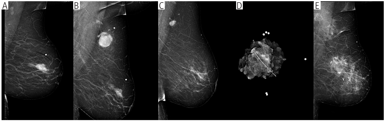
Fig. 1. The figure demonstrates different time points of the case history on single-view left side mammography. A) The screening medio-lateral-oblique (MLO) view at time 0 shows the primary tumour in the upper-outer quadrant. B) After recall, on day 27, the MLO view shows the tumour in the same location with a newly identified axillary metastasis. C) On day 83, before the introduction of the localising hooked wire, the tumour site and the metastasis are less evident on the ML view. D) The specimen mammogram shows the wire guided removal of the primary tumour site. E) The MLO view of the operated left breast on day 131 shows the clips in the tumour bed area, with no evidence of residual disease or calcification

node, which was not present on the screening mammogram (Fig. 1B); this measured 34 \times 25 mm on US. 14G needle core biopsy was obtained from the left sided primary tumour, and this resulted in a grade 3 (poorly differentiated) carcinoma with medullary features, also classified as lymphocyte predominant breast cancer with over 60% stromal mononuclear cells [8] (Fig. 2A). The phenotype was triple-negative, i.e. the tumour cells were negative for oestrogen receptors (ER), progesterone receptors (PR), and human epidermal growth factor receptor-2 (HER2), but showed cytokeratin 5 staining and high (about 60%) Ki-67/MIB1 labelling on immunohistochemistry. US-guided fine needle aspiration cytology was done on both axillary lymph nodes described, yielding a negative result on the right side and proving metastatic involvement on the left side (Fig. 2B). Magnetic resonance imaging of the breasts could not be performed due to the patient being