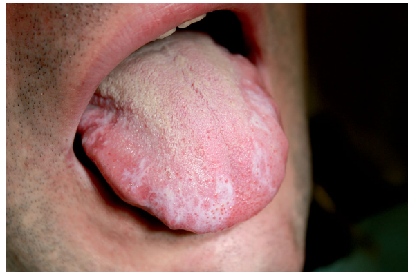
Fig. 2. Reticular lichen planus on the tongue in patient

role of similar immune reaction mechanisms responsible for the development of all the diseases described in their report. Kaniewska and Rydzewska suggested a possibility of coincidence of coeliac disease and other autoimmune disorders, e.g. chronic inflammatory bowel diseases, type I diabetes and primary biliary cirrhosis. According to the authors, introducing a gluten-free diet at the early stage of coeliac disease may prevent the development of other autoimmune conditions in these patients [8]. The coincidence of chronic inflammatory bowel diseases and pyoderma gangrenosum was also reported by some authors [10]. According to Wróbel et al. , autoimmune disorders that may appear together with lichen planus include graft-versus-host disease (GVHD), primary biliary cirrhosis and type B and C chronic hepatitis [9]. There have also been reports that confirmed the coincidence of lichen planus and chronic inflammatory bowel diseases – a situation also described in our paper. Giomi et al. described a case of a 37-year-old female with ulcerative colitis and lichen planus on the genital mucosa with no other skin or