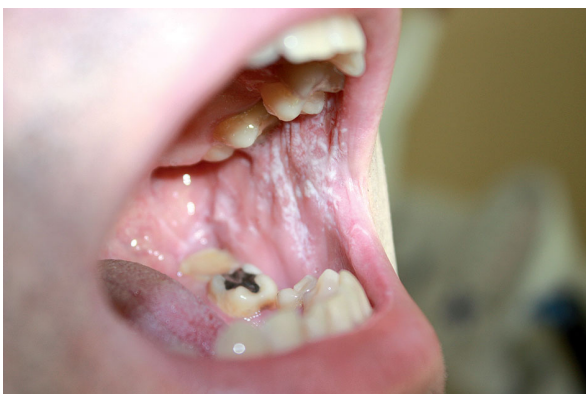
Fig. 1. Reticular lichen planus on buccal mucosa in patient