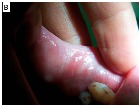
Figure 1 A–B. Heterogenic OL of buccal mucosae. The patient treated with tretinoin for 3.5 months. Partial remission was observed after 1 week of treatment, total remission after 2 months of treatment