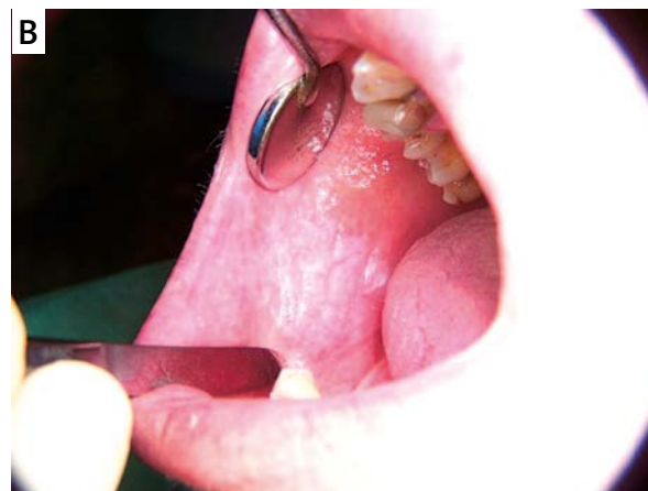
Figure 2 A–B. Homogenic OL of buccal mucosae. After 7 months of tretinoin treatment only partial regression of lesions was observed. The patient was treated by cryosurgery afterwards

statistically significant differences were observed. Statistically, relapses were observed more rarely in level I in comparison to other levels ( p = 0.004 ). In case of level III and IV – relapses were observed more often in comparison to other levels ( p = 0.05 and p = 0.02 ) (Table 6).