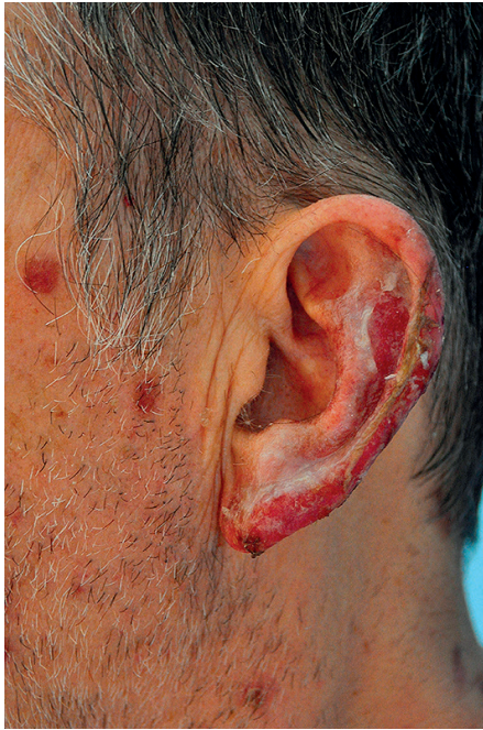
Figure 1. Left side of the face with macular and exfoliative skin lesions

no immune complexes neither in epidermis nor in the dermal-epidermal border. Blood, throat and urine cultures were also negative. Based on anamnesis, clinical appearance and histopathological image analysis, SJS/TEN was diagnosed.