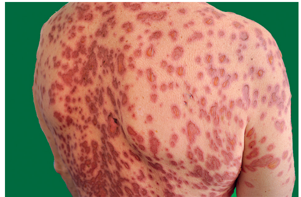
Figure 2. Well-margined, non-coalescing flaccid blisters and erosions of the trunk developed on the erythematous base. This is a rather uncommon presentation of SJS, more expected in pemphigus

It is very difficult to indicate a drug responsible for SJS/TEN development in the patient taking multiple medications at the same time, as in described case. In most incidents of drug-induced SJS/TEN, initial skin symptoms appear 2–3 weeks after suspicious medication application, but antibiotics can act more rapidly (a few days,