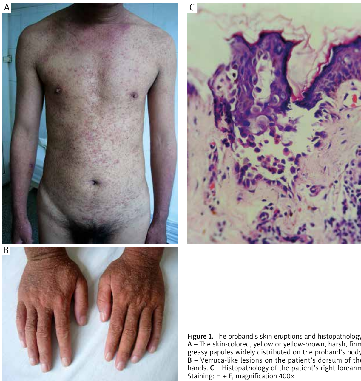
Figure 1. The proband's skin eruptions and histopathology. A – The skin-colored, yellow or yellow-brown, harsh, firm, greasy papules widely distributed on the proband's body. B – Verruca-like lesions on the patient's dorsum of the hands. C – Histopathology of the patient's right forearm. Staining: H + E, magnification 400×

more and more researchers agree that DD and AKV are variable expressions of the same disease, with the latter being a mild expression of the former. Whereas others maintain that AKV and DD are distinct entities on the basis of the difference in clinical, histological features and genetic locus [6–8].