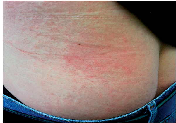
Figure 3. Premycotic stage of mycosis fungoides