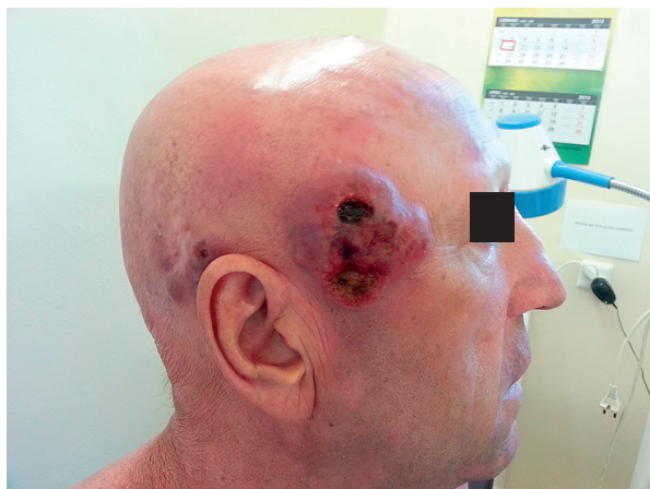
Figure 6. Tumour in mycosis fungoides