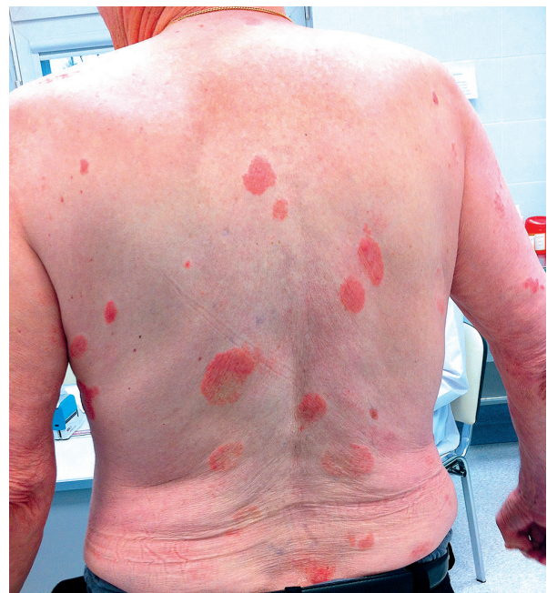
Figure 4. Plaques in mycosis fungoides