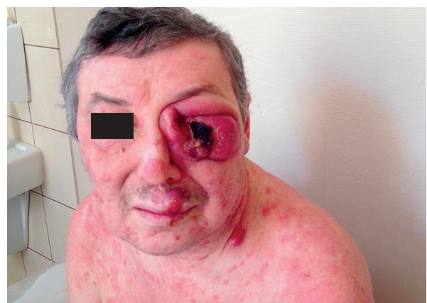
Figure 5. Mycosis fungoides – tumoral stage