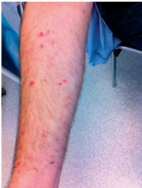
Figure 7. Lymphomatoid papulosis