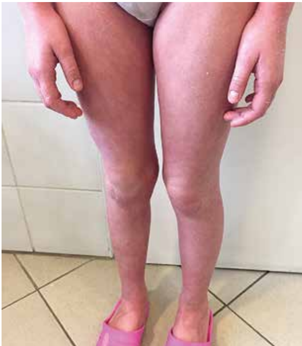
Figure 3. After 2 months the papules and plaques resolved completely with residual postinflammatory hyperpigmentation and xerosis cutis

In conclusion, we herein present an unusual case report showing that in paediatric population emotional stress can be the isolated trigger for the occurrence of PRP. Further investigations are needed to identify the pathomechanism of antecedent psychological stress and onset of PRP.