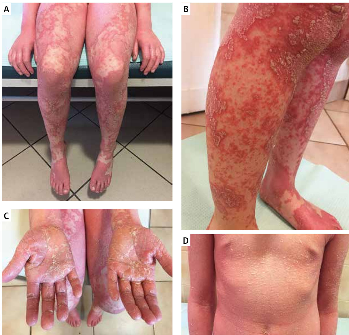
Figure 1 A, B – Hyperkeratotic papules, patches of normal skin and erythematosquamous plaques with an orange hue distributed on the legs. C – Waxy palmoplantar keratoderma with fissures. D – Confluent areas of erythema covered with diffuse pityriasisform scale on the trunk

clinical features consist of hyperkeratotic follicular papules and plaques that coalesce with islands of sparing and orange-hued palmoplantar keratoderma. Maximum spread is typically within 3 months. Mucosal involvement is uncommon [6]. It is considered to be prognostically favourable with a spontaneous clearance within 1–2 years [3]. The recurrence rate is about 17% [5]. PRP is diagnosed clinically with skin biopsy findings being supportive but not pathognomic. Characteristic histological features consist of psoriasiform hyperplasia, alternating orthokeratosis and parakeratosis (checkerboard pattern), follicular plugging and scanty superficial perivascular infiltrate within the dermis. Unlike psoriasis, in PRP neutrophils are not present in the epidermis or