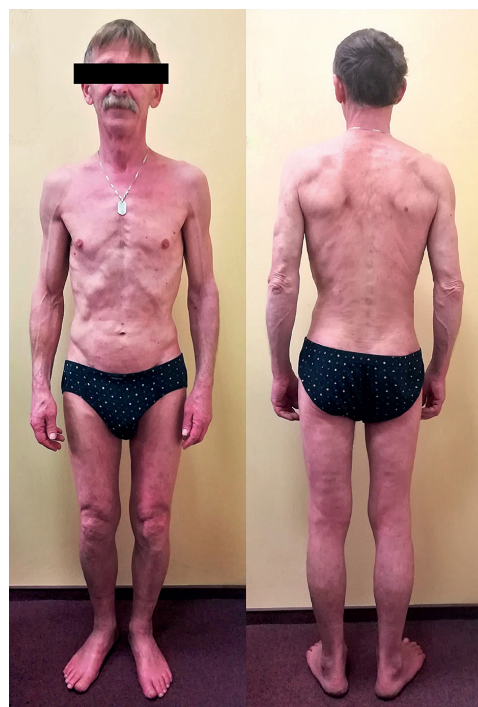
Figure 1. Dermatological status at admission – erythroderma

An elevated lymphocyte count ( 7.01 \times 10^3/\mu\text{l} , cutoff level: 4.50 \times 10^3/\mu\text{l} ) and white blood cell count ( 12.48 \times 10^3/\mu\text{l} , cutoff level: 11.00 \times 10^3/\mu\text{l} ) were found. Other de-