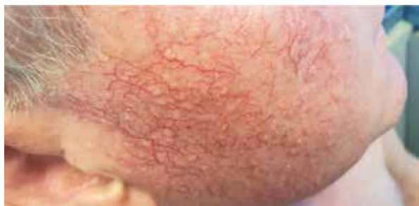
Figure 1. Demodicosis after organ transplantation.